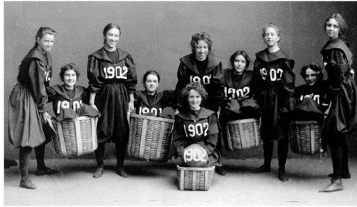
Smith College Class of 1902 Basketball Team (C.1902)