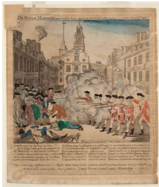
Paul Revere, "The bloody massacre perpetrated in King-Street Boston : on March 5th 1770 by a party of the 29th regt." (1770), Boston Public Library, Rare Books Department.