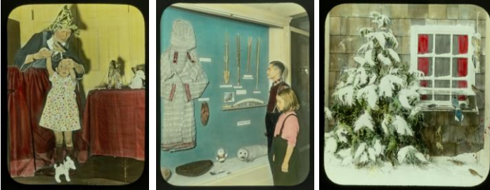
Three selected slides from the collection

This month features the Boston Children's Museum " Lantern Slide " collection. The magic lantern was an early form of projection device that was popular from the 18 th to early 20 th century. The Boston Children's Museum Collection features slides from the museum's founding in 1913 to 1960 and document the institution's history.