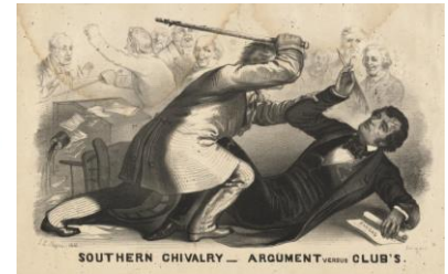
Most viewed item, 328 views